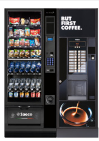
Artico M + Oasi 600