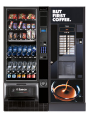
Artico S + Oasi 400